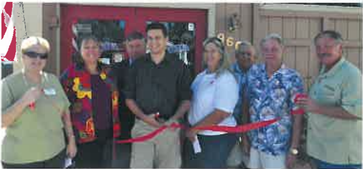
Stark White Studios