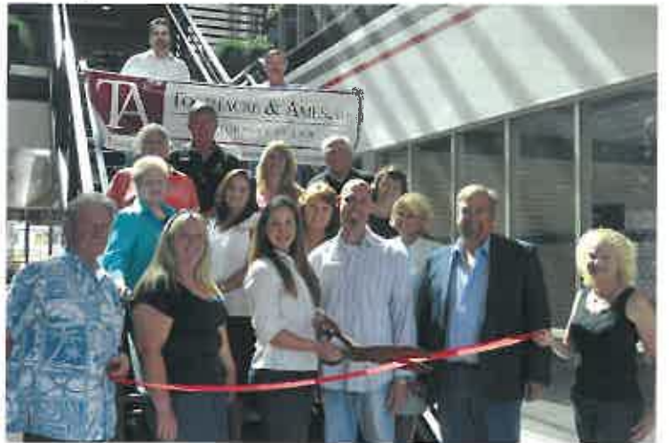
Toothacre and Ames, LLC