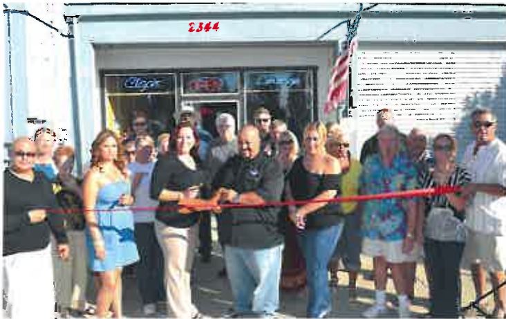
Stallion Cigar Club

August and September were busy months for the Ramona Chamber of Commerce as new members were added and ribbon cuttings were held.