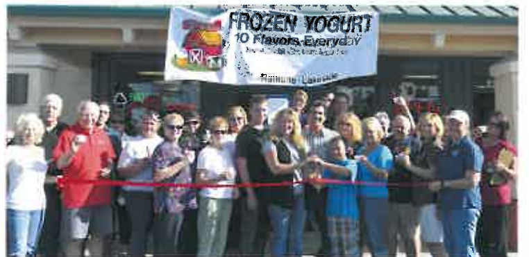
The Yogurt Barn