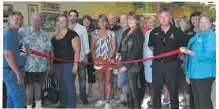
Sun Valley Florist