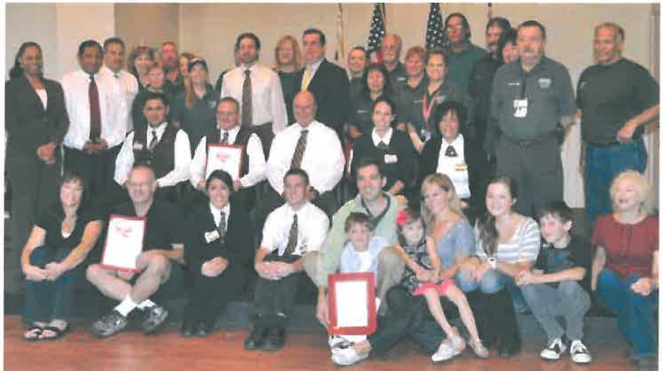
Businesses and organizations honored October 29 included Stater Bros., Ramona CERT, Ramona REAL, Cold Stone Creamery, and Ramona Family Naturals.

I'd like to share four of the stories I heard from my constituents in Ramona who helped their fellow community members survive a difficult situation. The Ramona Chamber of Commerce and I honored the work these citizens did in their community's time of need: