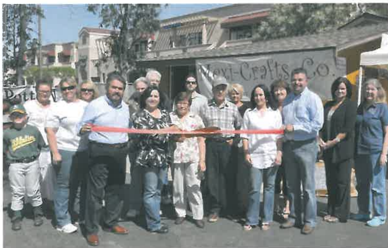
Mexi-Crafts and Nan's Place were welcomed as new Chamber members in April.