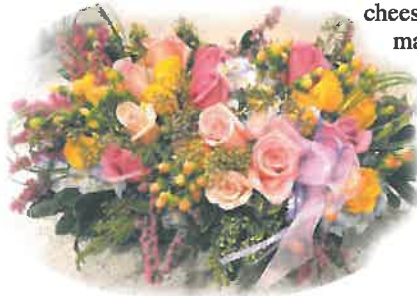
Happy Mother's Day

The shop is located at 758 Main St. For information, contact 760-789-3054, or visit www.sunvalleyflorist.com .