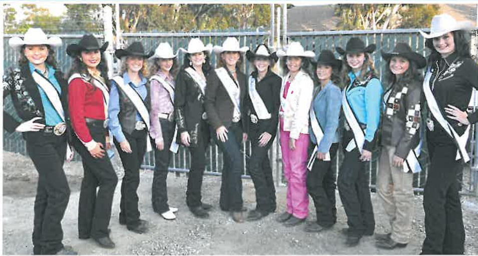
Current Ramona Rodeo Queens, center, are pictured with candidates for Senior Rodeo Queen and Junior Rodeo Queen.