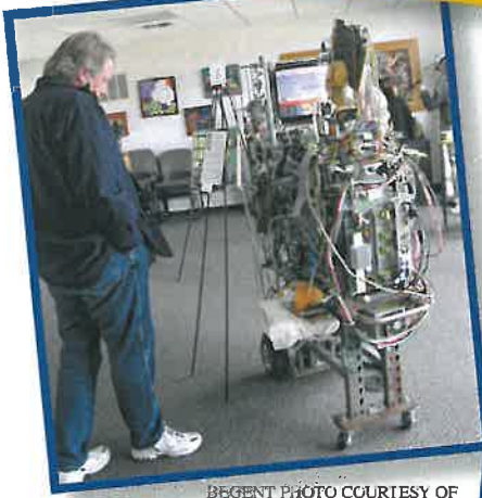
BEGENT PHOTO COURTESY OF HIGHLAND VALLEY STUDIOS