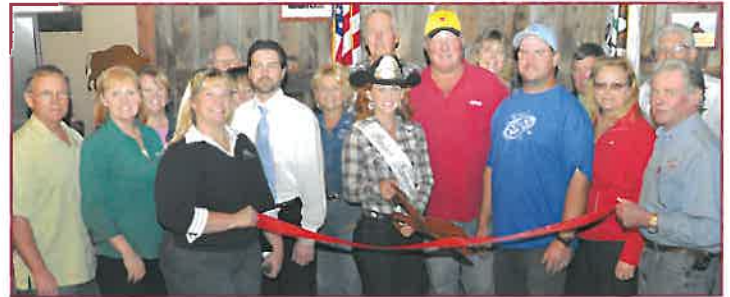
Ramona Outdoor Community Center Rodeo Office