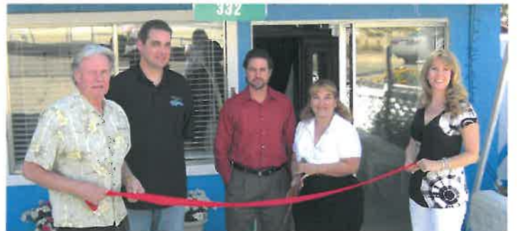
Cantrall Notary and Officiant Services