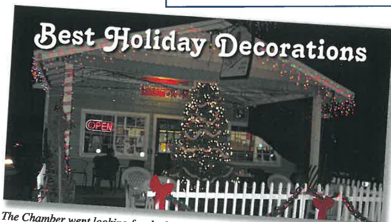
The Chamber went looking for the best decorations of this year's holiday season. Heavy rains the week prior to Christmas made it a challenge to all who participated. This year it was Packard's at Seventh and Main streets that best demonstrated the spirit of the season. Congratulations on a job well done! Four other businesses came close; they are Ramona Self Storage, Affordable Treasures, Ramona Business Barn, and new Chamber member ABK Electric.