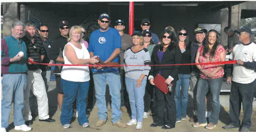
Ramona PONY Baseball became a Chamber member last month.