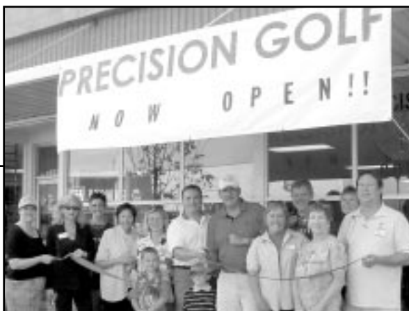
Chamber Ambassadors welcomed new member Precision Golf into Chamber membership recently. The business is located at 733-A Main St., next to the Town Hall, and offers a single-source solution for all golf needs.