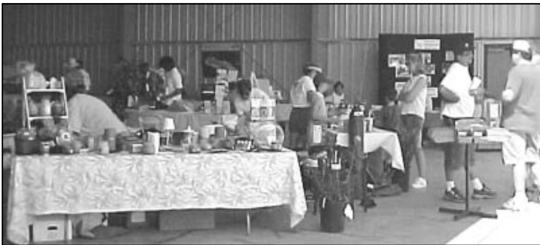
The second annual Business Expo, sponsored by the Ramona Chamber of Commerce and held during the annual Ramona Air Fair offered information about goods and services available in Ramona.