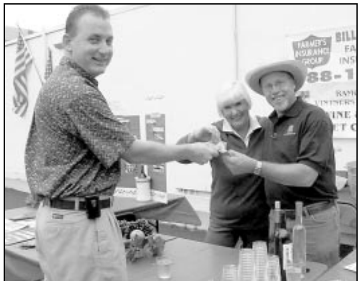
Ramona Vintners Association's wine-tasting table was popular at the June Mixer.

You won't want to miss our July 17 mixer, at Viejas Casino. This is always a popular mixer, and plans are being made for group transportation. Call the Chamber office at 789-1311.